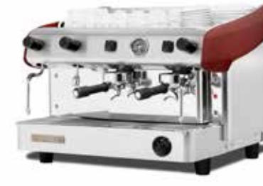
Pulser 2 GR, red