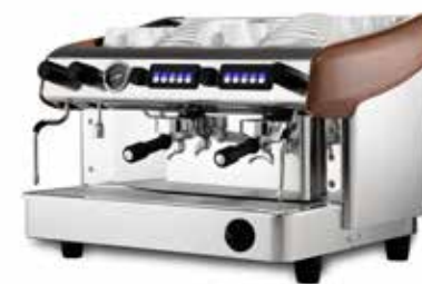
Control 2 GR, wood