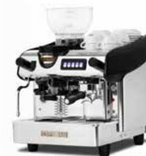
Mini Control 1 GR with grinder, black