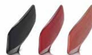
Black Red Wood