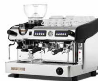
Control 2 GR with grinder, black