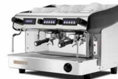
Display Control 2 GR, black