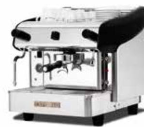
Mini Pulser 1 GR, black