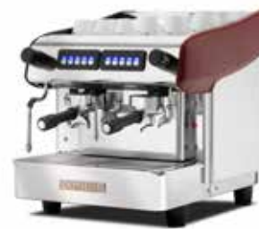
Mini Control 2 GR, red