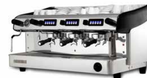
Control 3 GR, black