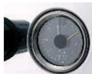
Dual Pressure Gauge