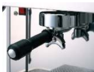
High Quality Components

Mono is highly suitable for the smaller café or bar that wishes to serve espresso, cappuccino and other espresso based drinks. And thanks to its tried and tested technology along with craftsman build quality you can count on years of trouble free service.