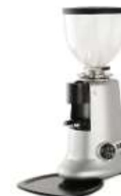
Expobar 600 Grind On Demand